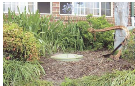
All that is visible of the pressure sewer tank once installed

Once installed, the licensed plumber will arrange an inspection by East Gippsland Water to commission and approve the sewer system for use. The plumber will also provide a plan of the system, including pipe location, to East Gippsland Water and the property owner.