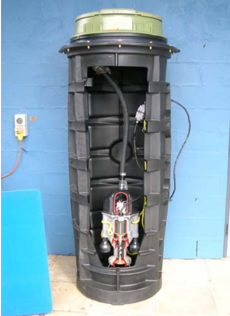
Example of a pressure sewer tank and pumping unit

A pressure sewer system can be installed economically at any site, regardless of the terrain. It requires only shallow trenches and relatively small 40mm diameter piping within the property boundary, increasing up to 100mm diameter in the street.