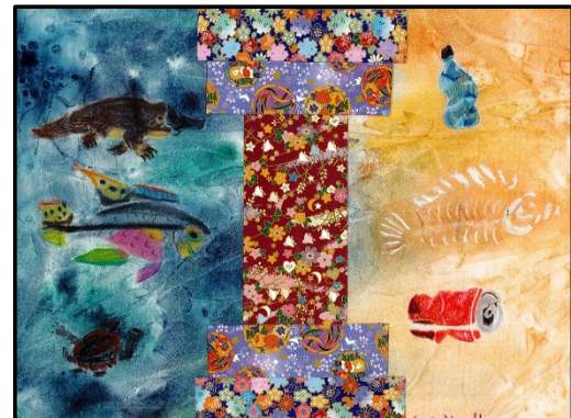
By: Tess Venables Gippsland Grammar, Bairnsdale