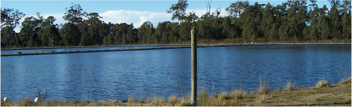
Cann River winter storage lagoon