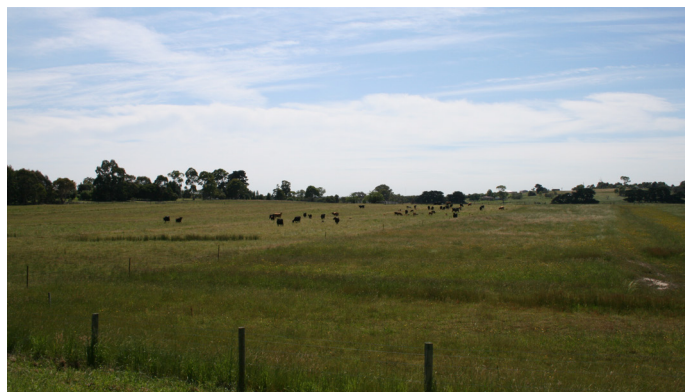
Metung Farm owned by East Gippsland Water receives treated wastewater for irrigation