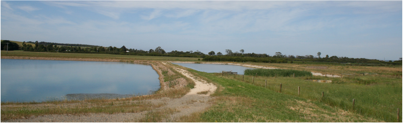
Lagoons at the Metung Wastewater Treatment Plant