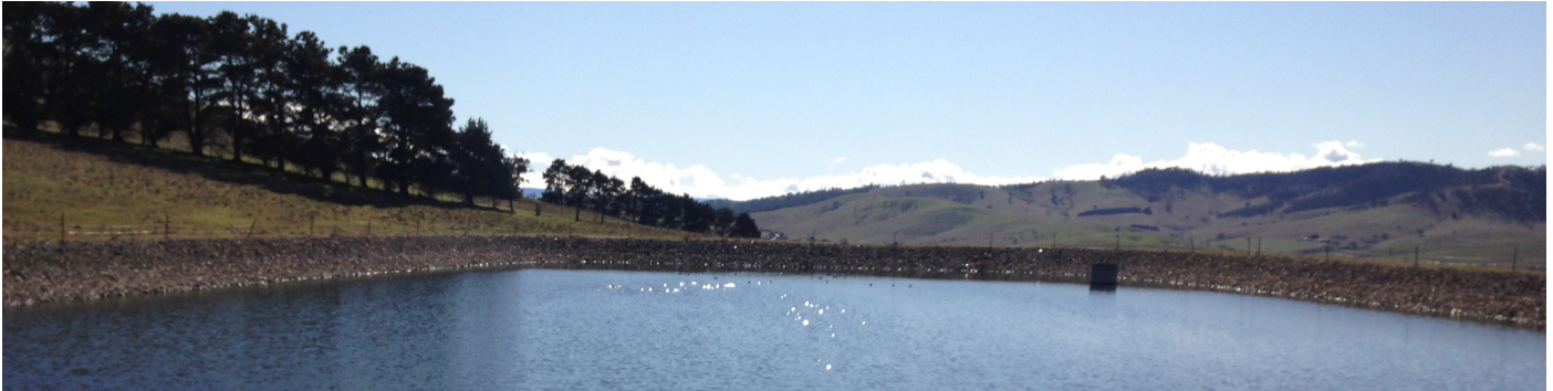
The Omeo Wastewater Treatment Plant