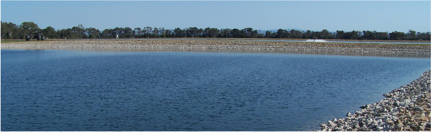
Paynesville treatment lagoons