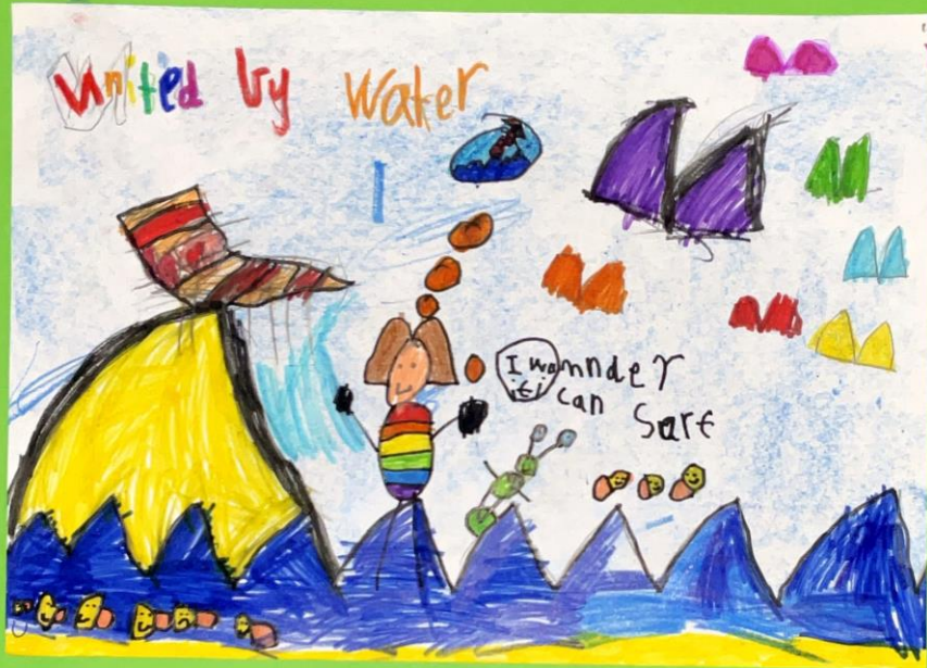
Maizie Prep Swanreach