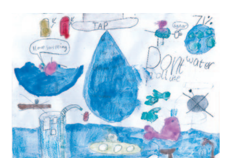
Grade 1-2 - Cambell from Buchan Primary School