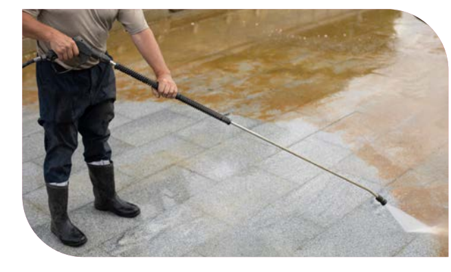
HARD SURFACES including driveways, paths, concrete, tiles and timber decking

Permanent Water Saving Rules and Water Restrictions do not apply to tank, bore or grey water.