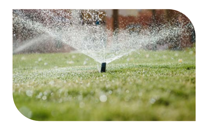
PUBLIC GARDENS, LAWNS AND PLAYING SURFACES

Water from a hand-hand held hose can be used if it is leak-free and fitted with a trigger nozzle. A residential or commercial garden or lawn can be watered between 6pm to 10am with a watering system or with a hand-held hose, bucket or watering can at any time.