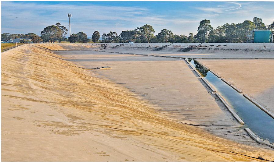
Wy Yung basin being drained.

This $6 million project involves the replacement and/or repair of any drainage pumps, floats, access hatches, underdrainage system, stabilisation of the clay liner and the installation of a new geomembrane liner and floating cover. Fabtech, a company specialising in the design and installation of geomembrane liners and covers is undertaking the works, which will take around six months to complete, weather dependent.